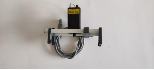
Universal Scanning Head