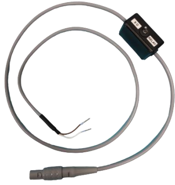
Box for SO or Relay Output